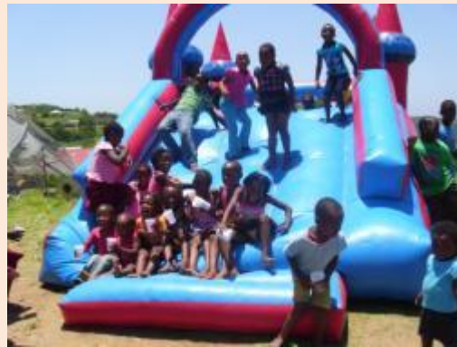
Nsimbini Information Centre