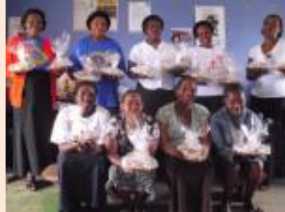
Voluntary Care Workers

For the first time we were able to give the voluntary care workers who work so unselfishly without remuneration a small gift as a token of our appreciation.