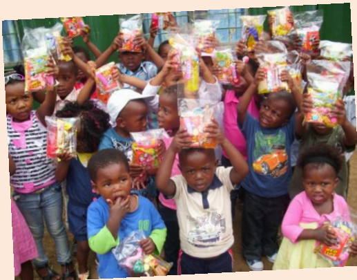
Khanya Langa Pre-School

Khanya Langa Pre-school children thoroughly enjoyed the cake, ice cream and snacks.